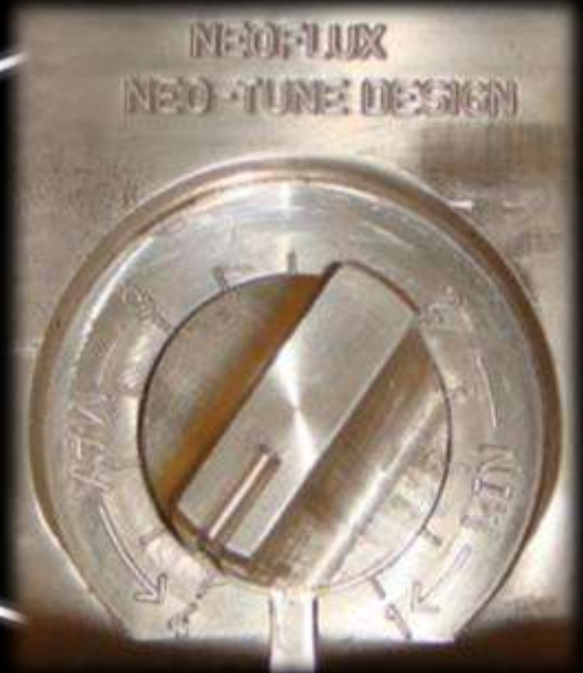
Air Adjustment Knob

This design incorporates Air-Regulator for discharge efficiency.